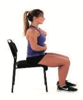
Step 2 technique