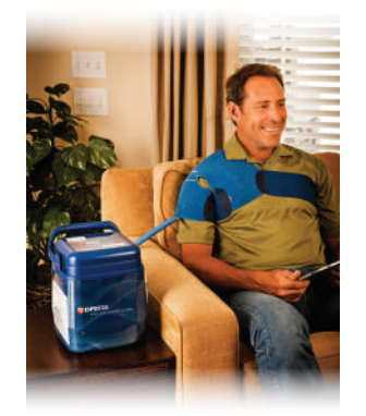
3. During Recovery Designed to get you back to regular activity, the Polar Care Cube is lightweight, compact, quiet, and easy to use.