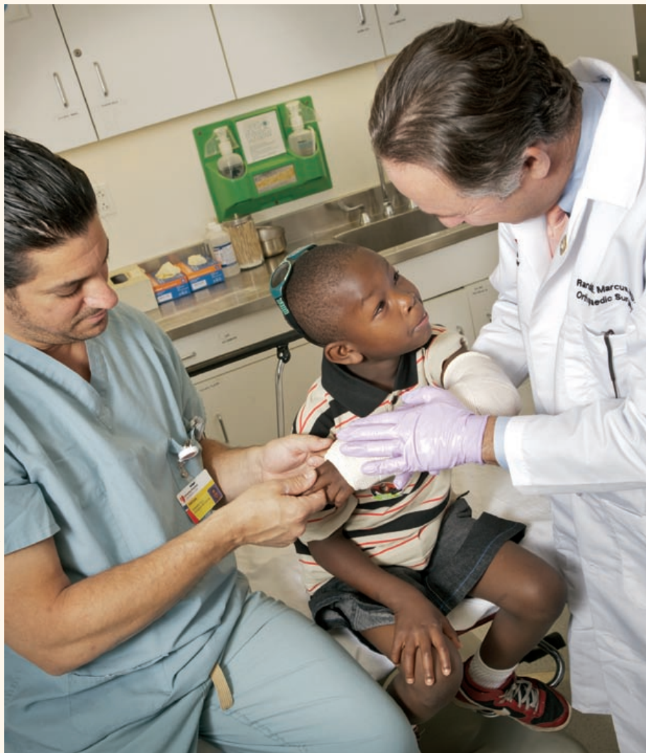
The Department of Orthopaedics at UHMC offers a broad spectrum of surgical and non-surgical treatments for patients of all ages with minor to major musculoskeletal problems resulting from trauma, infection, inflammation, arthritis, tumors and deformity.