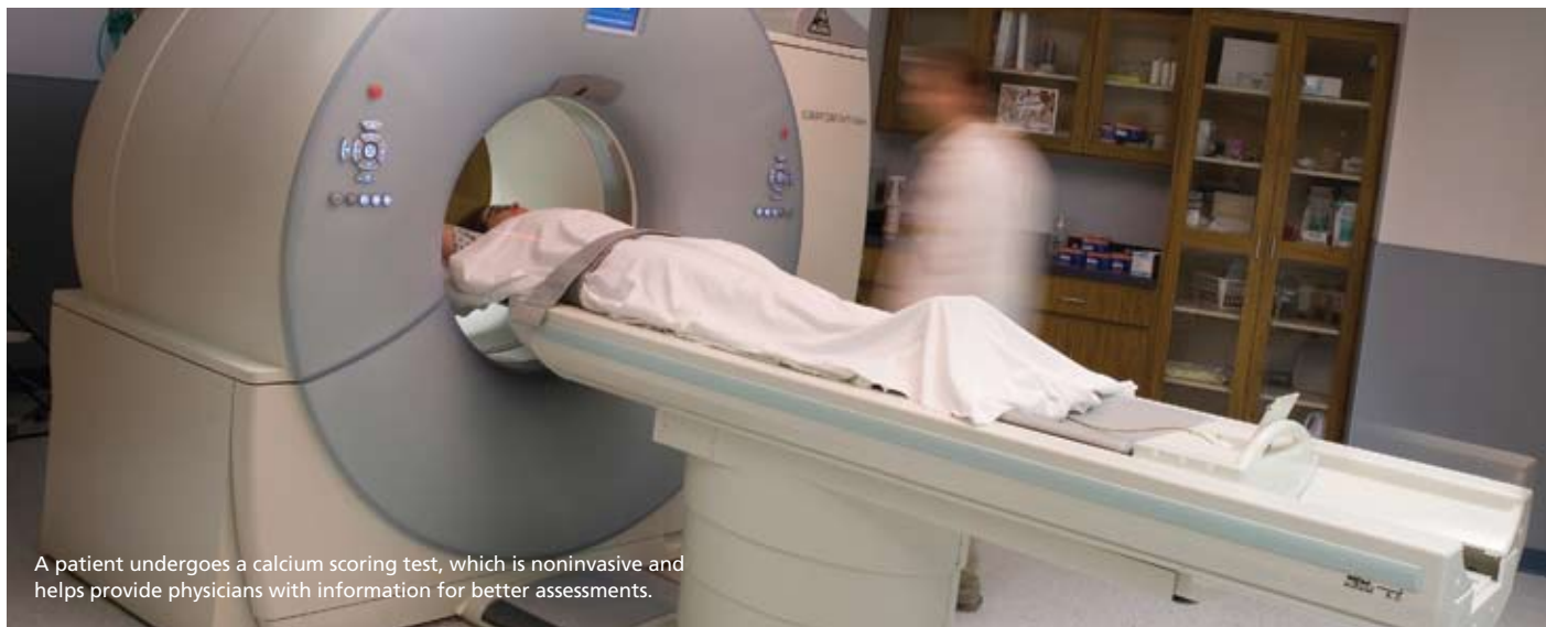
A patient undergoes a calcium scoring test, which is noninvasive and helps provide physicians with information for better assessments.