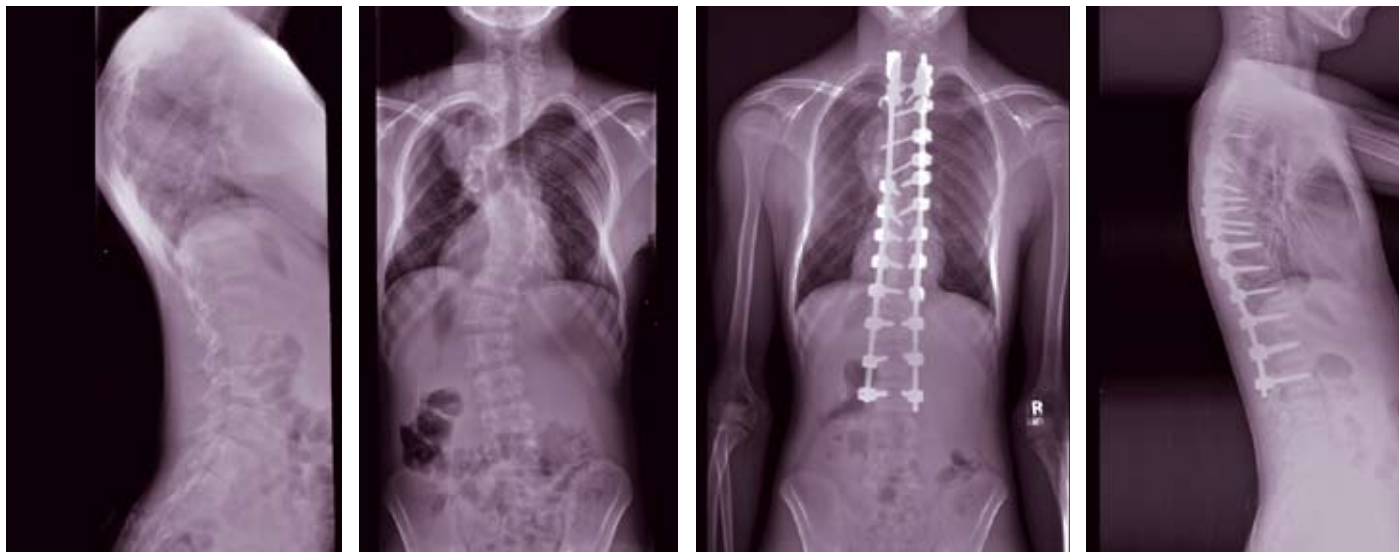
Left and left-center: Neurofibromatosis scoliosis in a 13-year-old boy. Right-center and far right: After a staged anterior and posterior spinal fusion with interim halo traction, the boy's spinal deformity was much improved.

A UH Case Medical Center physician finds an alternative when VATS is not an option