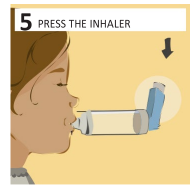
Press the inhaler one time. This puts one puff of medicine into the spacer.