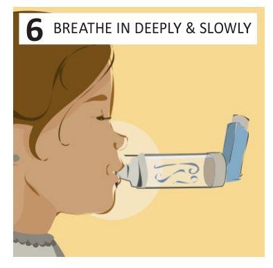
Breathe IN deeply but SLOWLY. **Breathe in slower if the spacer whistles**