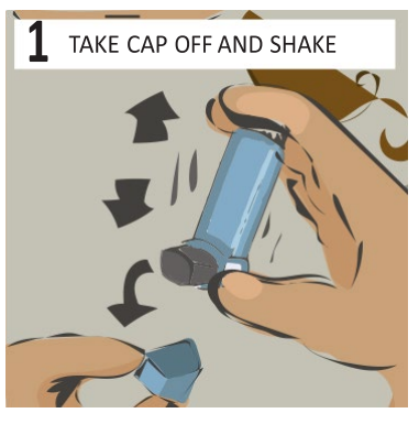
Remove cap from mouthpiece of inhaler and spacer. Shake inhaler well.