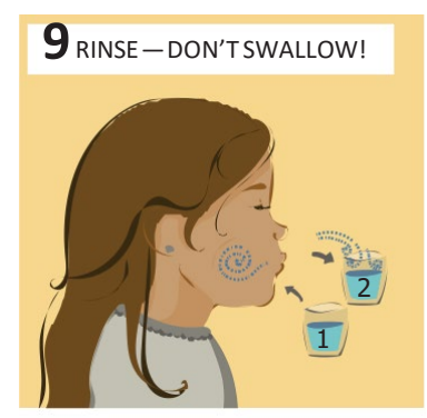
Rinse mouth if the medicine taken was an inhaled steroid. Do not swallow the water