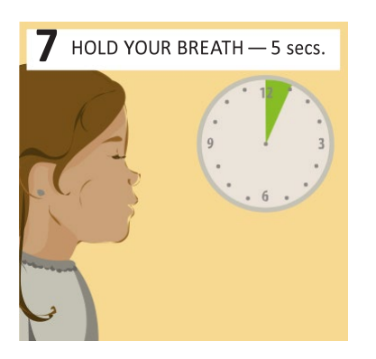
Hold breath for 5 seconds before breathing out.