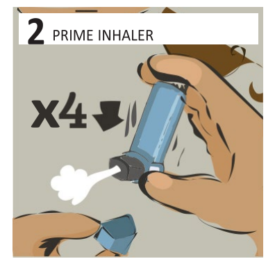
Prime the inhaler by spraying out 4 puffs of medication if the inhaler is new or hasn't been used in 2 weeks or longer.