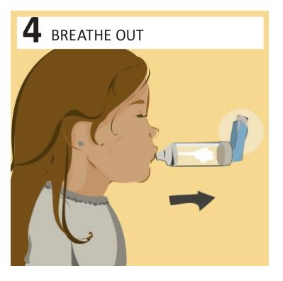
Place lips around spacer mouthpiece. Take a deep breath IN and then breathe OUT slowly into the spacer.