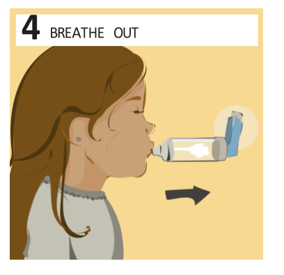
Place lips around spacer mouthpiece. Take a deep breath IN and then breathe OUT slowly into the spacer.

From the American College of Chest Physicians Ilustrations by Paula Falco