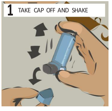
Remove cap from mouthpiece of inhaler and spacer. Shake inhaler well.