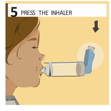
Press the inhaler one time. This puts one puff of medicine into the spacer.