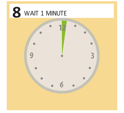
If your child needs to take another puff of medicine, wait 1 minute. After one minute, repeat steps 4 to 7.