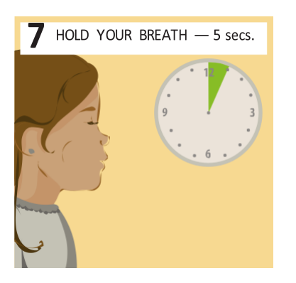
Hold breath for 5 seconds before breathing out.