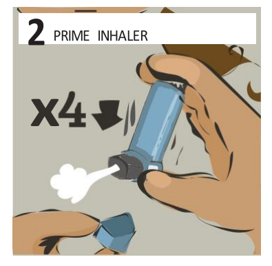
Prime the inhaler by spraying out 4 puffs of medication if the inhaler is new or hasn't been used in 2 weeks or longer.