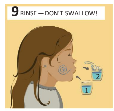
Rinse mouth if the medicine taken was an inhaled steroid. Do not swallow the water.

Scan code for video demonstration of how to use albuterol inhaler with a facemask