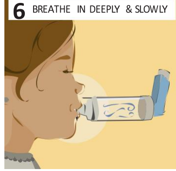
Breathe IN deeply but SLOWLY. **Breathe in slower if the spacer whistles**